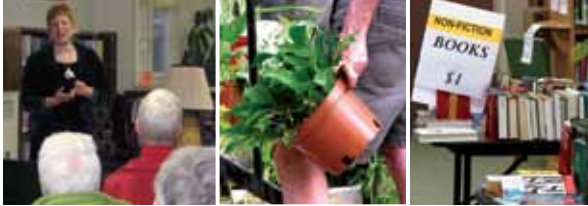
Our educational events, plant sales, and book sales promote interest and bring in valuable funds