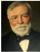
—Andrew Carnegie, Benefactor of the Rockingham Free Public Library

“Building a Library outranks any other one thing that a community can do to benefit its people. It is the never failing spring in the desert.”