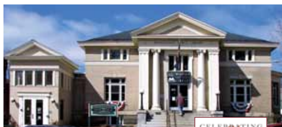
The Rockingham Free Public Library in Bellows Falls, Vermont