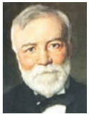
—Andrew Carnegie, Rockingham Free Public Library Benefactor

“Building a Library outranks any other one thing that a community can do to benefit its people. It is the never failing spring in the desert.”