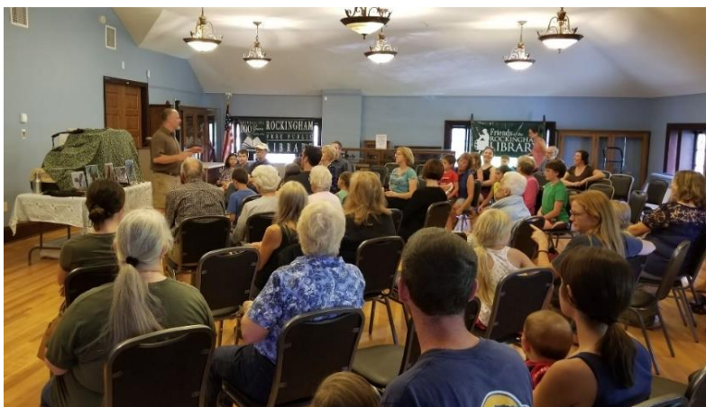
Southern Vermont Natural History Museum's Raptors Program