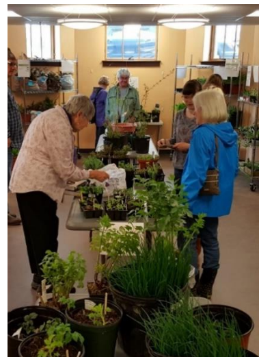
Friends of the Library's May Plant Sale